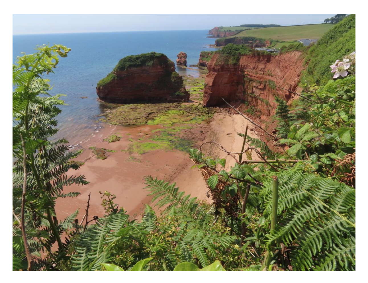
The view from the coast path of the impressive sea stacks including Hern Rock before Ladram Bay.

We left the caravan park walking along Lower Larderham Lane to cross Ladram Road and continuing on Bredon Lane where we saw wonderful barley fields 'waving' in the breeze. At one stop, someone spotted a dragonfly ... no-one could identify it from four metres away with the naked eye - it took me ages before I spotted the distinctive large and impressive dragonfly.