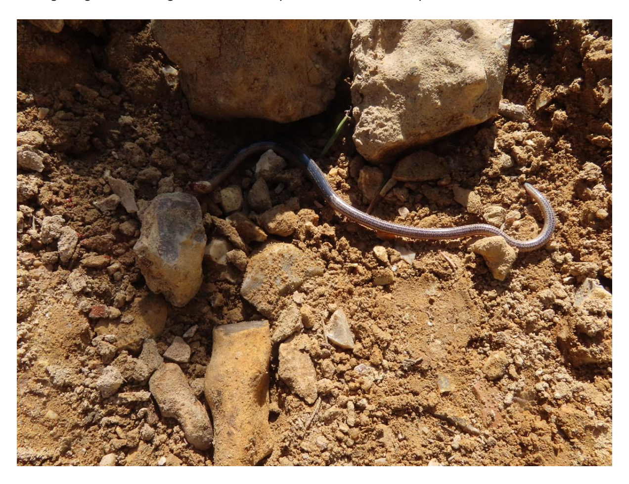
The injured slowworm

On the way up we spotted a slowworm - unfortunately, it was injured. Nine of us went up to the top to 'bag a trig' as well as a great view. The way down was a bit skittery on the loose stones.