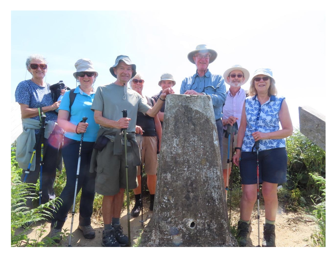
Nine of us went up: here's eight of them ... I was behind the camera!

We continued along the coast path - a workman from the EDDC was replacing a post in the kissing gate down from the woods as be descended towards the Ladram Bay caravan park. As there have been cliff/rock falls, the path cuts inland before emerging into the centre of the complex with the welcome relief of the toilets.