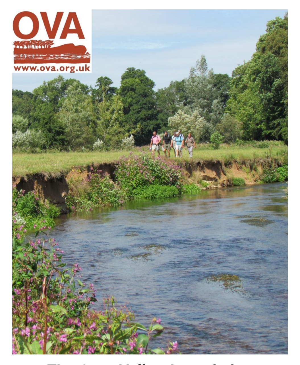
The Otter Valley Association TRUSTEES' REPORT for the year ended 31 March 2015