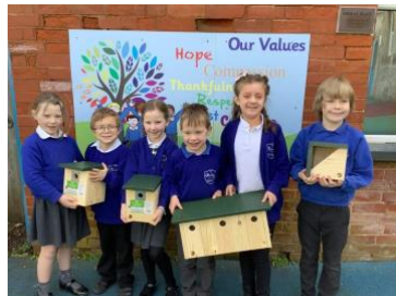
Church of England School, Otterton