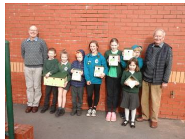
St. Peters School, Budleigh Salterton

This has even been covered in the local press (click here to see our article in the Exmouth Journal entitled " Wildlife-loving pupils receive bird boxes from OVA "). Here is a picture from the same article.