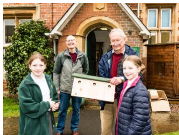
Church of England School, East Budleigh

In order to further support interest in the environment, the OVA is producing leaflets that provide information for those wishing to encourage wildlife into their gardens.